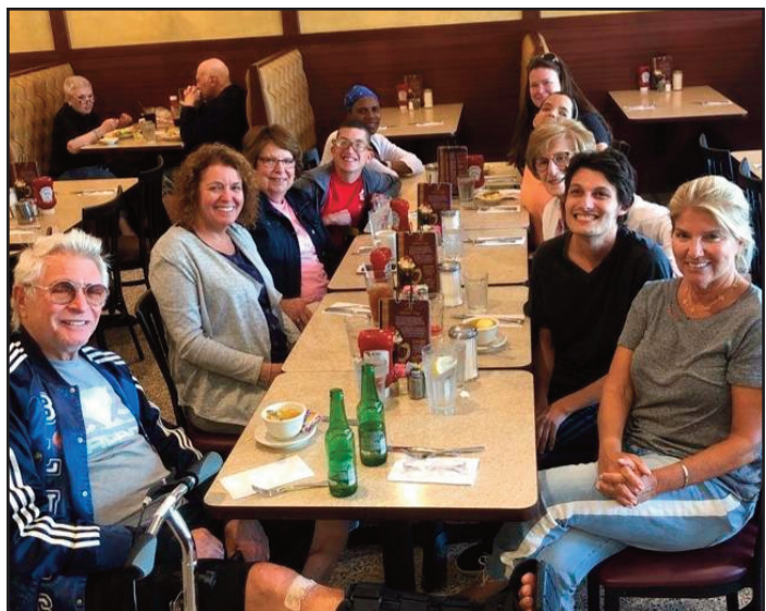
Oceanside NCBC members enjoying their time together.

For more information on how to become a Next Chapter Book Club facilitator please call us at (516)867-3580.