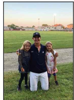
Summer, for us, is marked by baseball, but it's about so much more than just the mechanics of the sport.